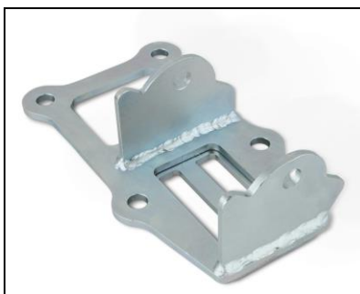
Figure 1 – Driver's side mount